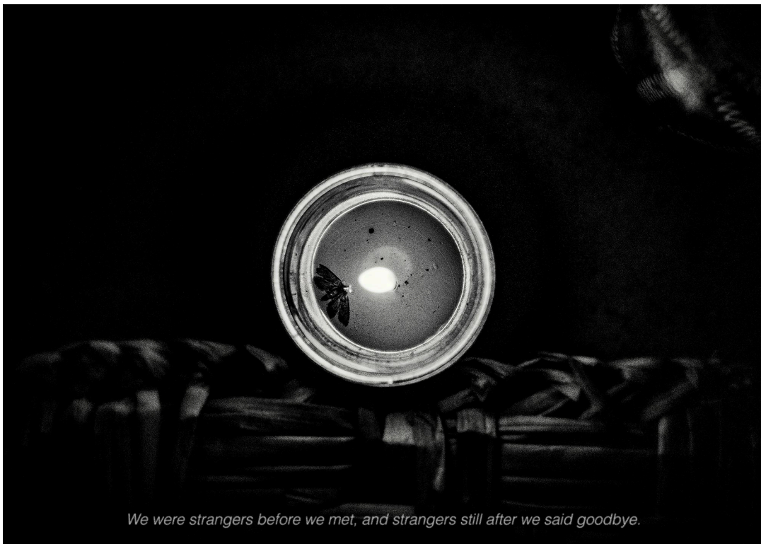
Untitled 6156, from the series Echoes of the Disposable 2024, Archival Pigment Print, 57.1cm x 80cm.