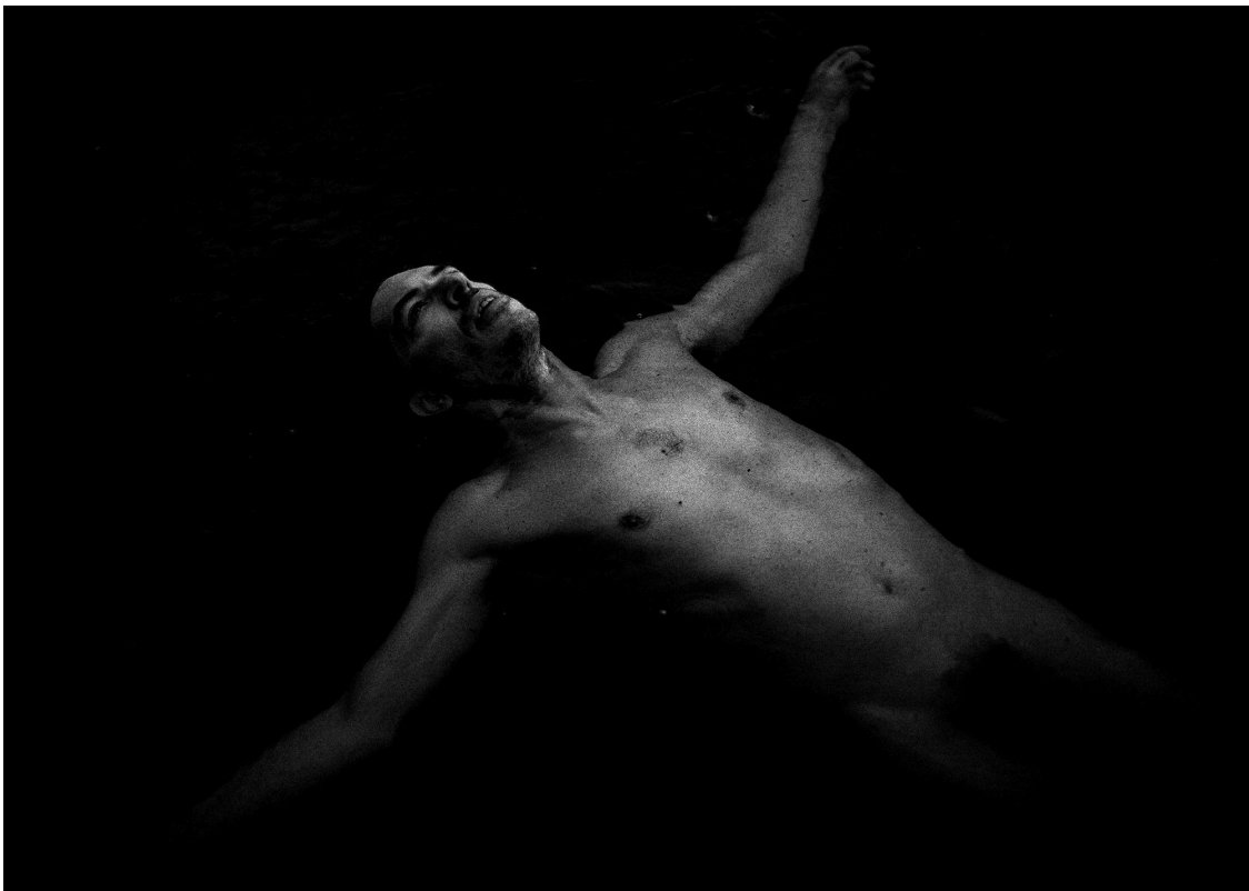
Untitled 9019 , from the series Echoes of the Disposable . John Londoño, 2024, Polyvinylchlorid (PVC) Print, 200cm x 280cm.

A web version, including Press Images download, is available at www.johnlondonodiary.com/press-release